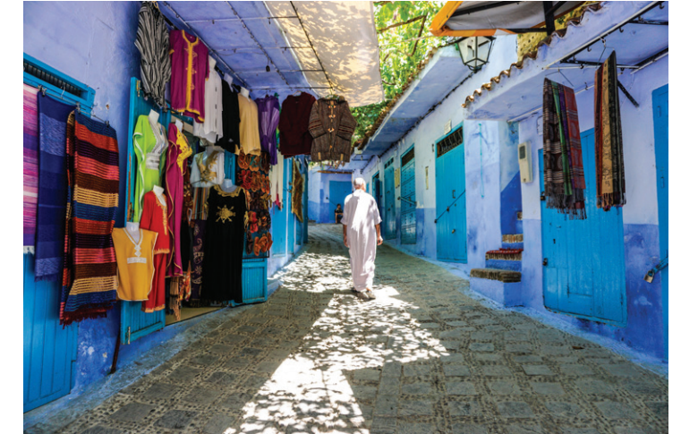
Chefchaouen Street 13" x 20" Archival pigment print on plaquemount