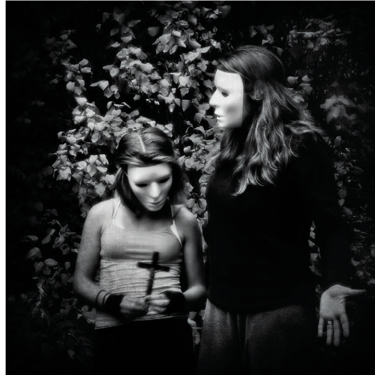
Story 30 10" x 10" Archival pigment print

Titles or verbal clues are purposely eliminated. Photographs are labeled Story followed by an identifying number. Like Zen koans, sources of mysterious contemplation, or Rorschach ink blots, I invite observers to imagine what each image intuitively evokes. Reactions will be unique to every viewer. I have learned to trust this interactive process, allowing for the subject/photographer collaboration to expand my depth as an artist.