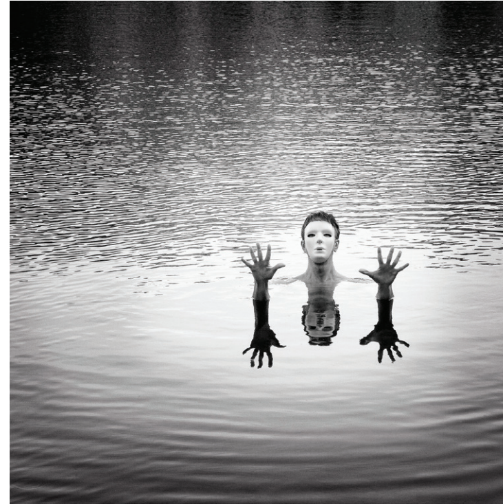
Story 7 10" x 10" Archival pigment print