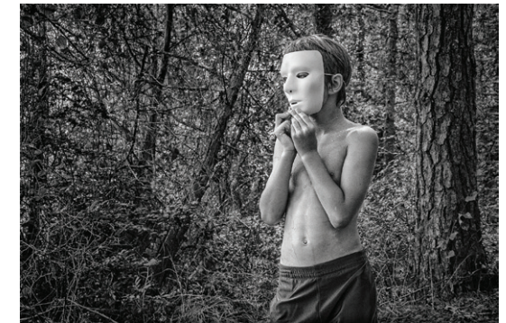
Story 14 10" x 16" Archival pigment print