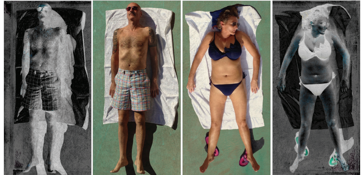
Paulo and La Donna, Overexposed 40" x 20" Quadritypch each panel Photo transfer on tengucho paper, encaustic medium on birch box