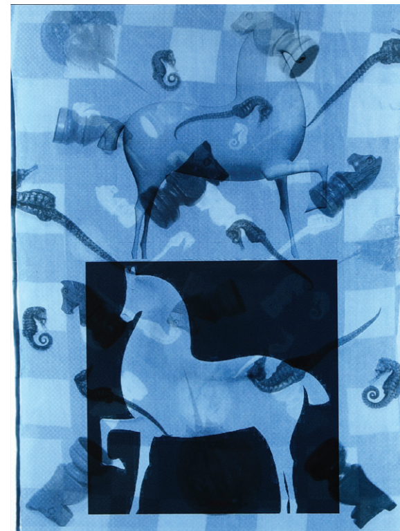
Nathan/Inspiration 11" x 8.5" Cyanotype on silk layered with digital negatives and positives in backlit frame