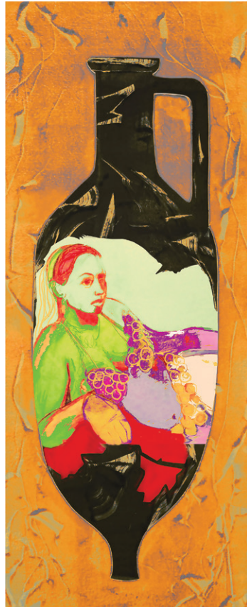
Dancer 40" x 16" Monotype, and pastel drawing, digitally merged

As a printmaker, I make use of processes such as monotype, lithography, etching, and altered photographs. Manipulation of inks and plates is physical, and contact with materials is both fresh and alive. Using digital technology opens ways for me to combine images and cross between time and place.