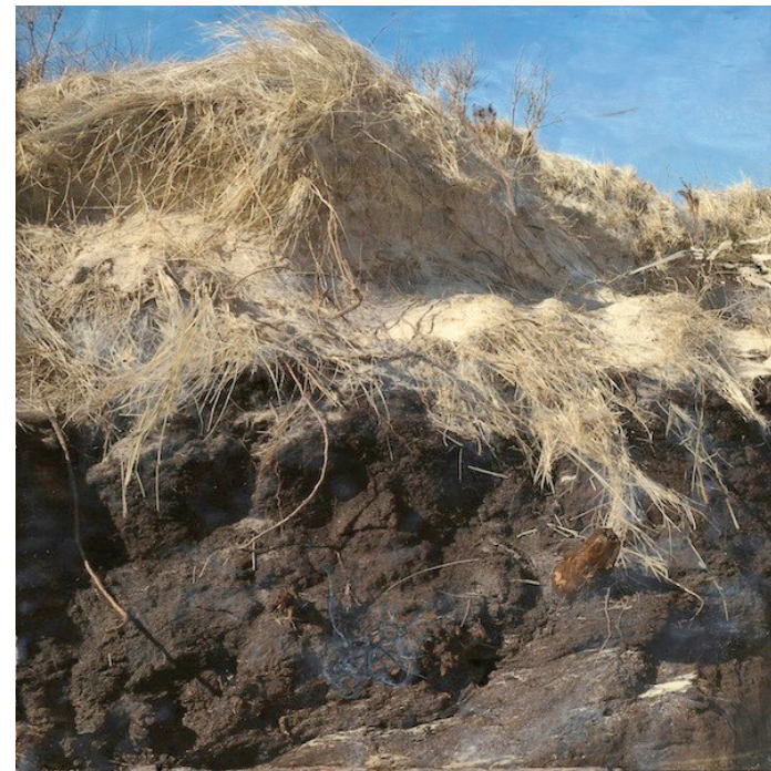
Ancient Cedar Bog 24" x 24" x 1.5" Archival inkjet transfer, straw, string, twigs, magnetite, encaustic, wood