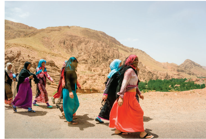
On the Road 13" x 20" Archival pigment print on plaquemount