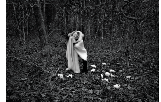
Story 2 9" x 14" Archival pigment print