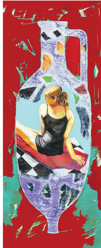
Sleeping 40" x 16" Monotype, and pastel drawing, digitally merged