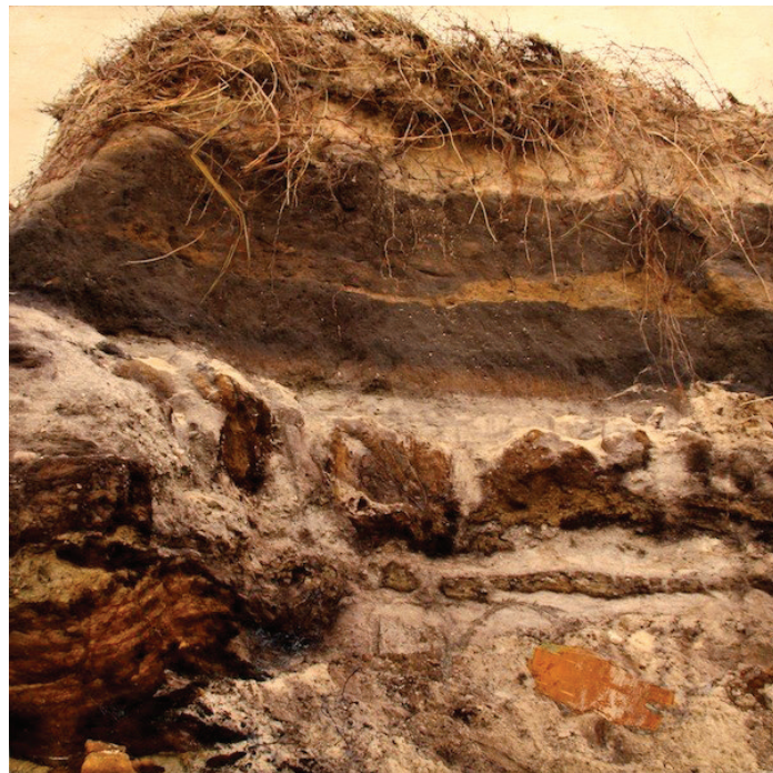
Layers Revealed 24" x 24" x 1.5" Archival inkjet transfer, grasses, leaves, bark, eel grass, encaustic, wood

Ancient Cedar Bog Beneath portrays a cedar bog exposed in the winter of 2013 at Coast Guard Beach. The enlarged digital print was transferred to a birch panel, allowing the wood grain to filter through the imagery and contribute to the resonance of the final artwork. After sealing the transfer with encaustic medium, organic fragments and actual oxides from the earth were imbedded in additional layers of encaustic. This process permanently protects the imagery and creates a luminous surface patina. Layers progress slowly, evolving with no preconceived final stopping place, as in nature, where circumstances of weather choreograph unplanned vistas.