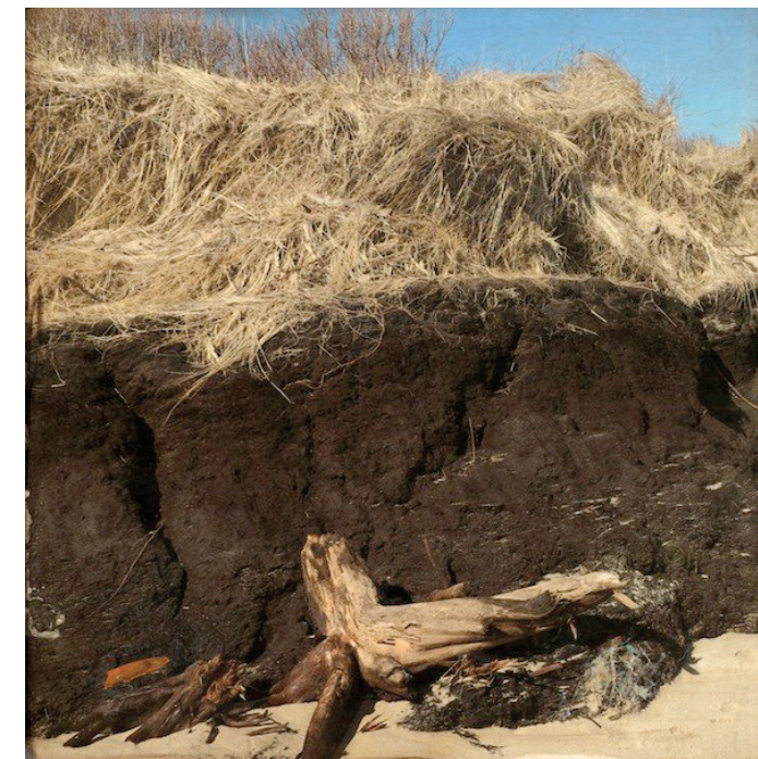
Ancient Cedar Bog Beneath 24" x 24" x 1.5" Archival inkjet transfer, straw, string, bark, rusted iron fragments, encaustic, wood