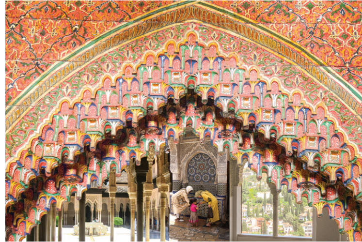
Moorish Arches 13" x 20" Digital photomontage, dye-infused metal print

In my travels I am always fascinated by what lies behind what my eyes first grab. I long to read the half-hidden story behind a veil or a door ajar. Monumental gates and arches that abound in the old world are a treasure trove for such discoveries and are the inspiration for this work.