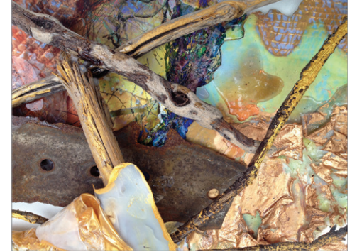
Totem 1 (opposite page) 44" x 24" x 4" Digital prints, metal, wood, foam board, lichen, polymer, shells, acrylic paint, lutradur, adhesives